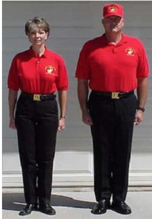
Uniform "A" Figure 8