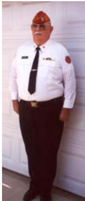
Undress - Long Sleeve Figure 3

Standard fore and aft MCL cover with gold USMC eagle, globe and anchor emblem