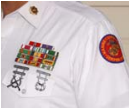
Undress - Short Sleeve Figure 4

Standard fore and aft MCL cover with gold USMC eagle, globe and anchor emblem