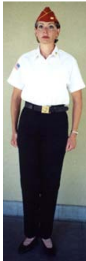
Female Uniforms Figure 5