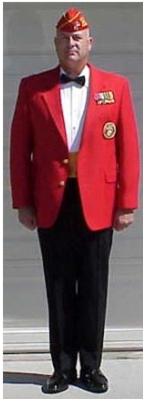
Formal Dress Figure 1

Standard fore and aft MCL cover (may be omitted for indoor events)