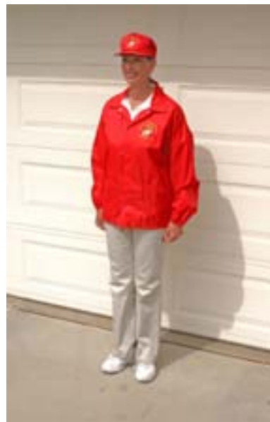
Jackets Figure 11