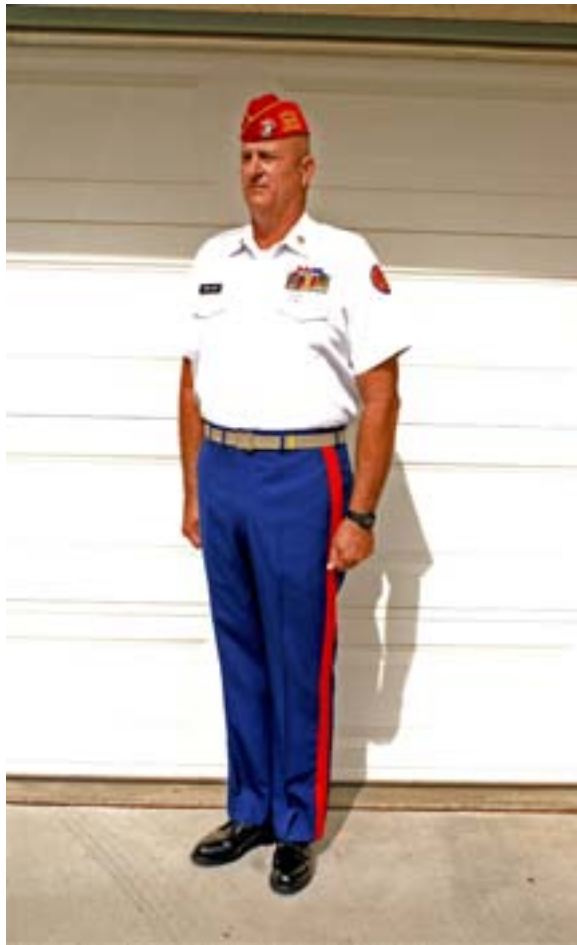
Ceremonial Uniform Figure 7