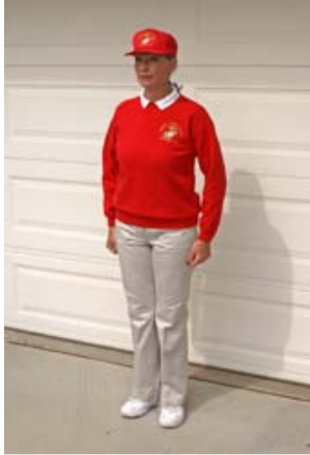
Sweatshirt Figure 12