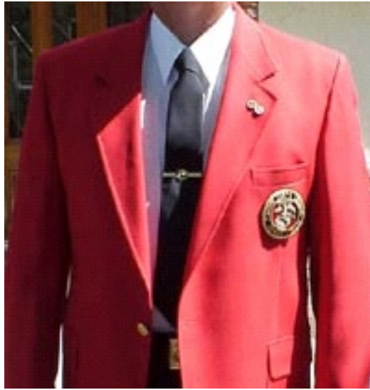
Casual Dress Figure 2

MCL red blazer w/MCL blazer crest w/o miniature medals Lapel pins (maximum of two) on the left lapel at the largest outward point (generally covering the existing button hole of the blazer) Black trousers (plain front) Black belt w/brass USMC buckle; the wearer's right side aligned with the trouser zipper line and shirt line (gig line) White dress shirt w/plain collar (no button downs), no emblems, patches or shoulder lapels Black four-in-hand tie w/USMC or MCL tie bar (worn between the second and third shirt buttons) Black socks Black, highly polished, plain toe shoes Standard fore and aft MCL cover with gold USMC eagle, globe and anchor emblem