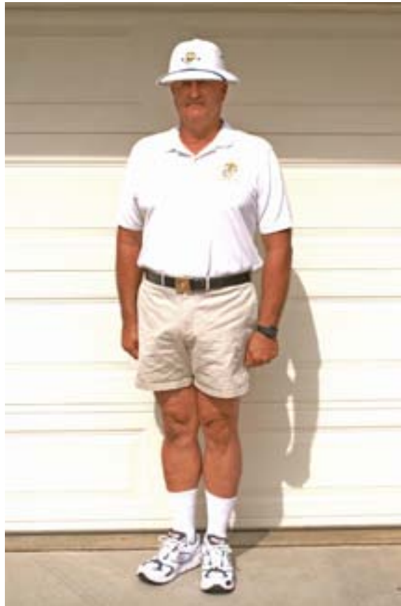
Ushering Uniform Modified Khaki Shorts and Pith Helmet Figure 10

Khaki shorts may be substituted for the khaki trousers (plain front) Black service belt w/brass USMC buckle centered on the trouser zipper line White polo shirt (no pocket) w/MCL emblem embroidered on left breast White socks Tennis shoes, low top White pith helmet w/polished brass Marine Corps emblem may be substituted for the red MCL baseball cap w/embroidered MCL emblem