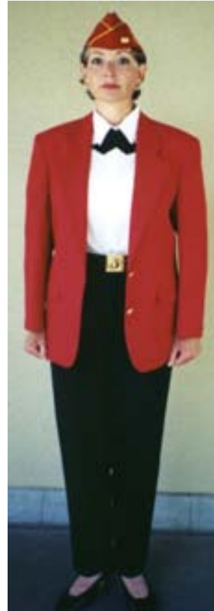
Associate Member Uniforms Figure 6